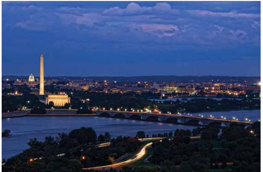
A view of Washington, D.C., at twilight showing the Potomac River and the Memorial Bridge connecting Arlington, Virginia, and the District of Columbia.