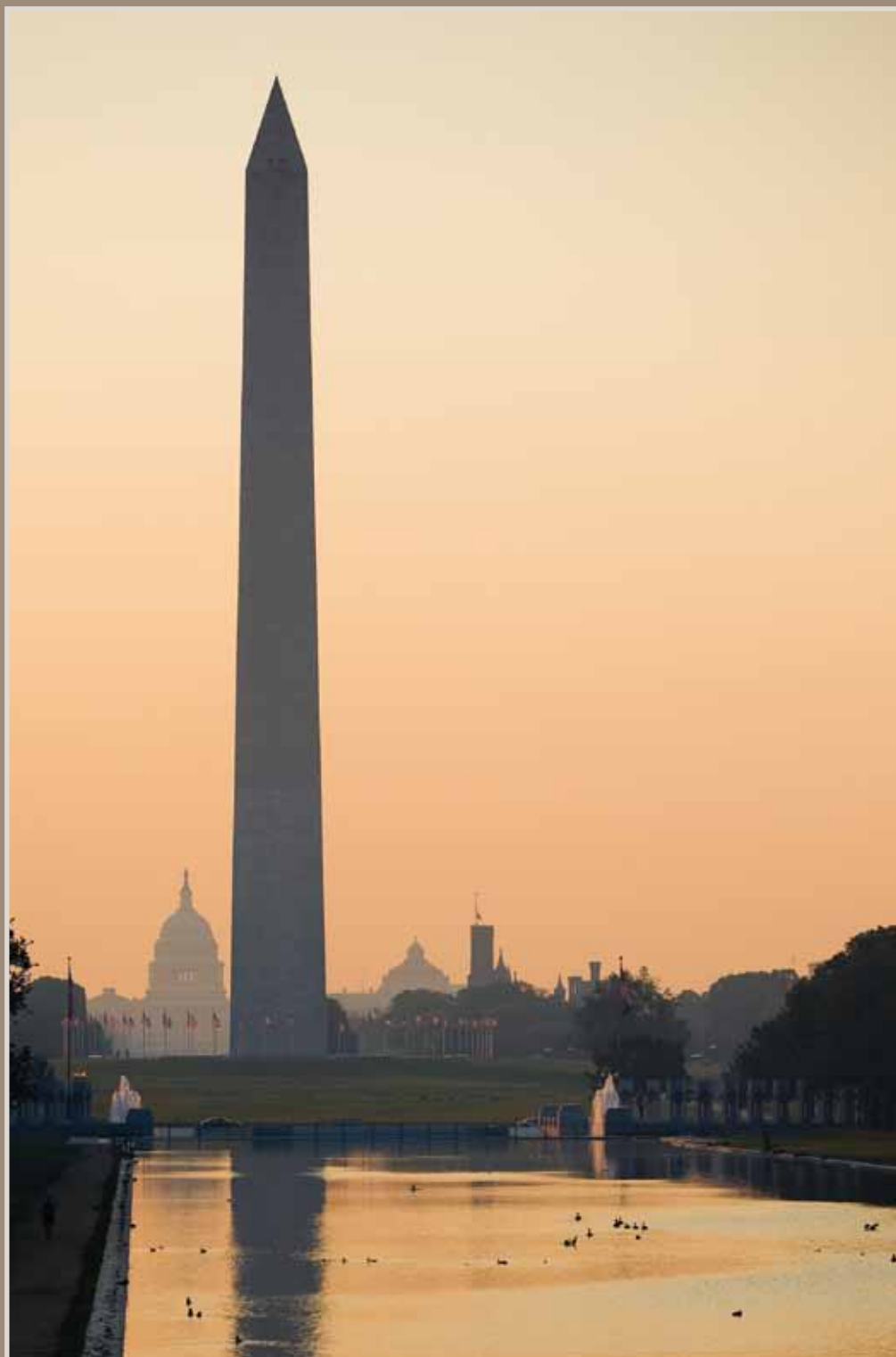
On the Doorstep of the Nation's Capital