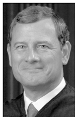
John G. Roberts, Jr. Chief Justice of the United States

born Jan. 27, 1955, Buffalo, NY raised Long Beach, IN appointed from MD