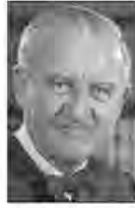
John Paul Stevens Associate Justice Oath: Dec. 19, 1975