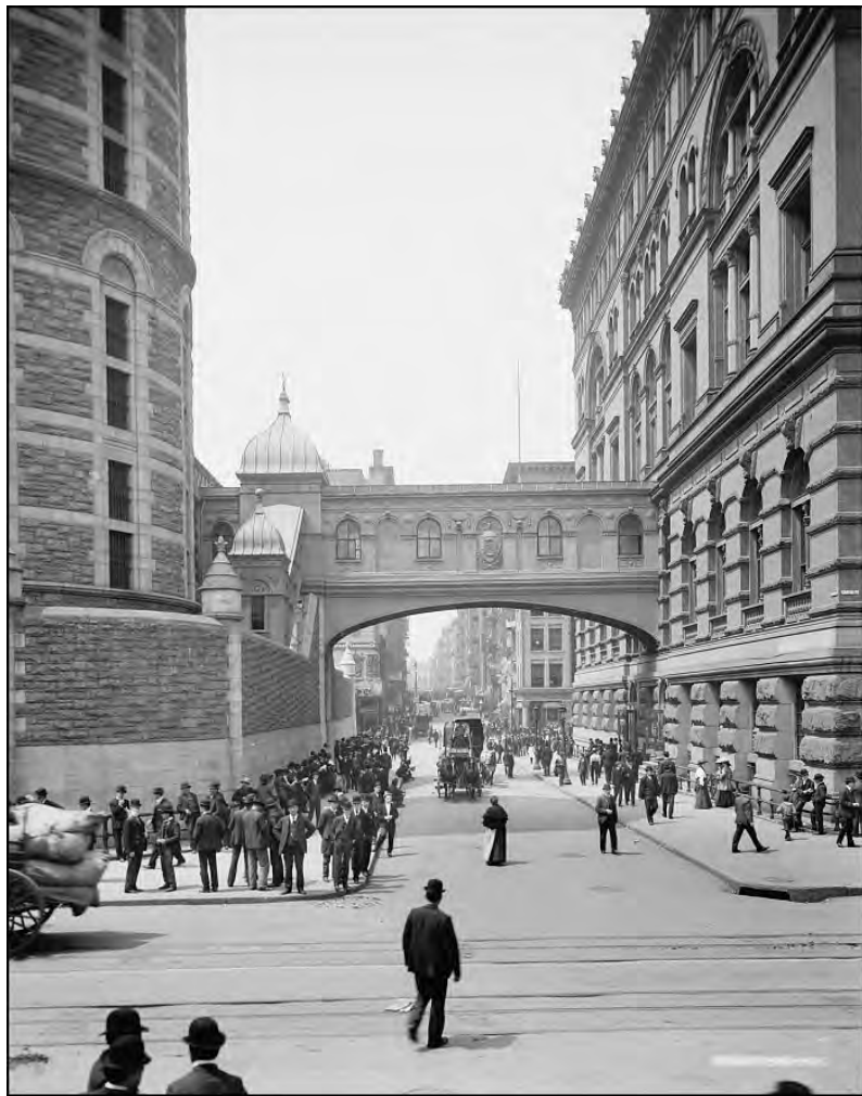
Looking across Centre Street and down Franklin Street, under the “Bridge of Sighs” between The Tombs (left) and the Criminal Courts Building (right), in which genuine General Sessions (including Part 6) of the New York Supreme Court were held during the time of Judge Fraser Manton’s fictional tenure (circa 1905).

was alleged — as the newspapers say — to have planted a bomb in his neighbor’s hallway, asked permission to withhold his plea for twenty-four hours, which was granted. Two others followed — a druggist charged with illegal sales of heroin, and a weak-faced youth, whose employer had missed a thousand dollars from his