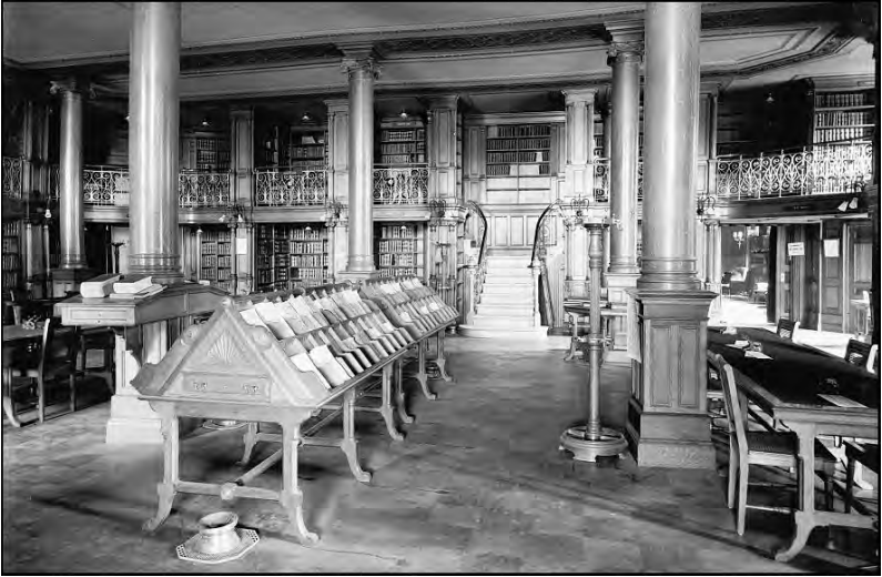
The law library of the Lawyers' Club in the Equitable Building, New York City (circa 1900).

"Ah!" Again Judge Manton's brows were lifted. "I suppose you have a good reason."