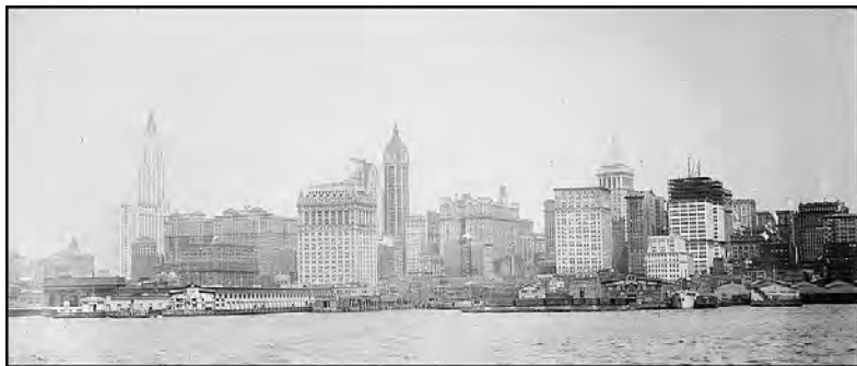
The New York City skyline in 1913, with the brand-new Woolworth Building (then the tallest building in the world) on the left and the Singer Building (once the tallest) in the center.

The lawyer looked up to find Dan standing before him.