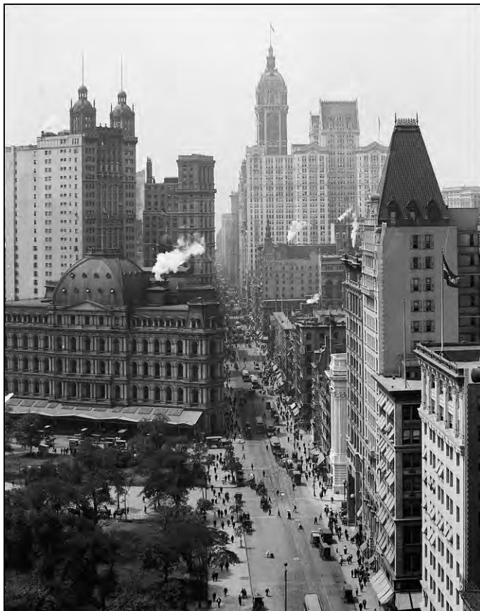
The view down Broadway from Chambers Street, with the Post Office on the left beyond City Hall Park and the Singer Building towering in the distance (circa 1910).

“It’s mighty curious,” he muttered disgustedly, “that I shouldn’t find one letter, or one book with his writing in it, or anything.”