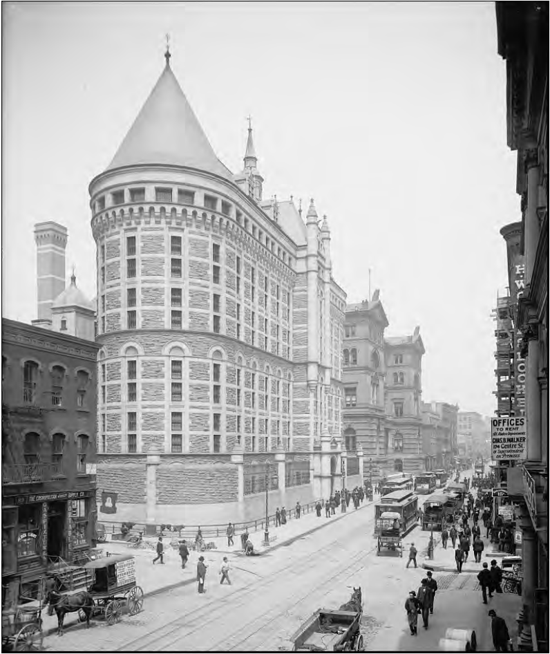
Looking north up Centre Street, across Leonard Street at the Manhattan House of Detention — “The Tombs” — in New York (circa 1905).

The first business after the calling of the calendar was a batch of indictments sent over from the grand jury.