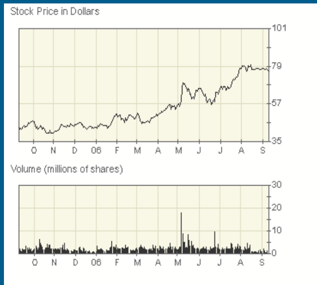
Inco's 1 year Share Price