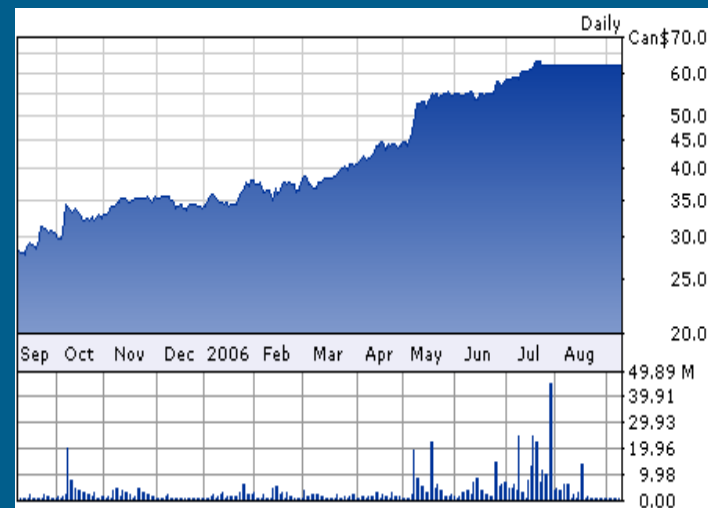
Falconbridge's 1 year Share Price